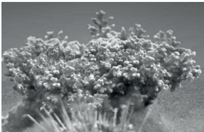
Natural source of minerals

2. Celtical strengthens the gut barrier and reduces leaky gut , as well as working anti-inflammatory. This improves general health and reduces mortality.